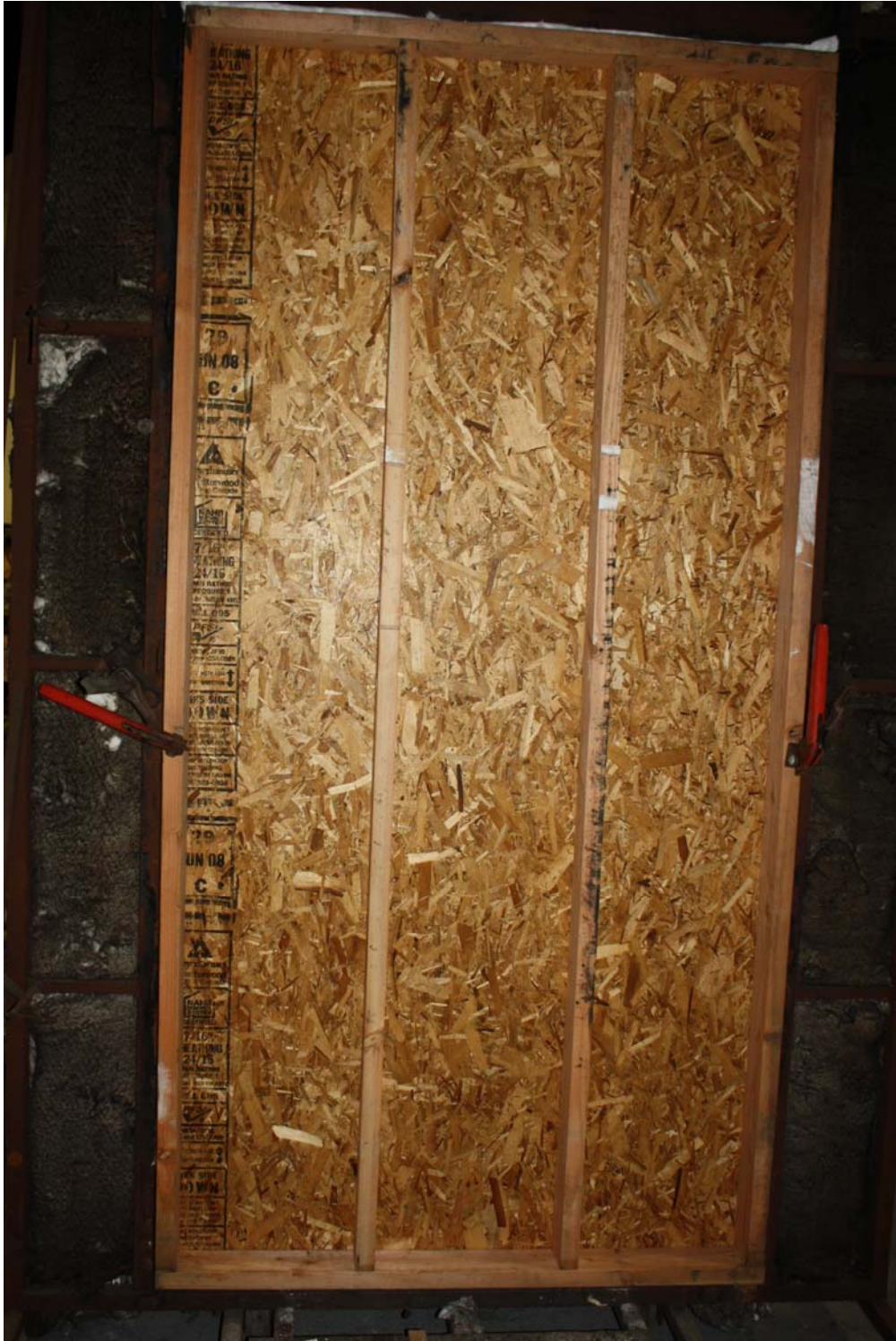
Test 1, beveled channel, unexposed side at test termination