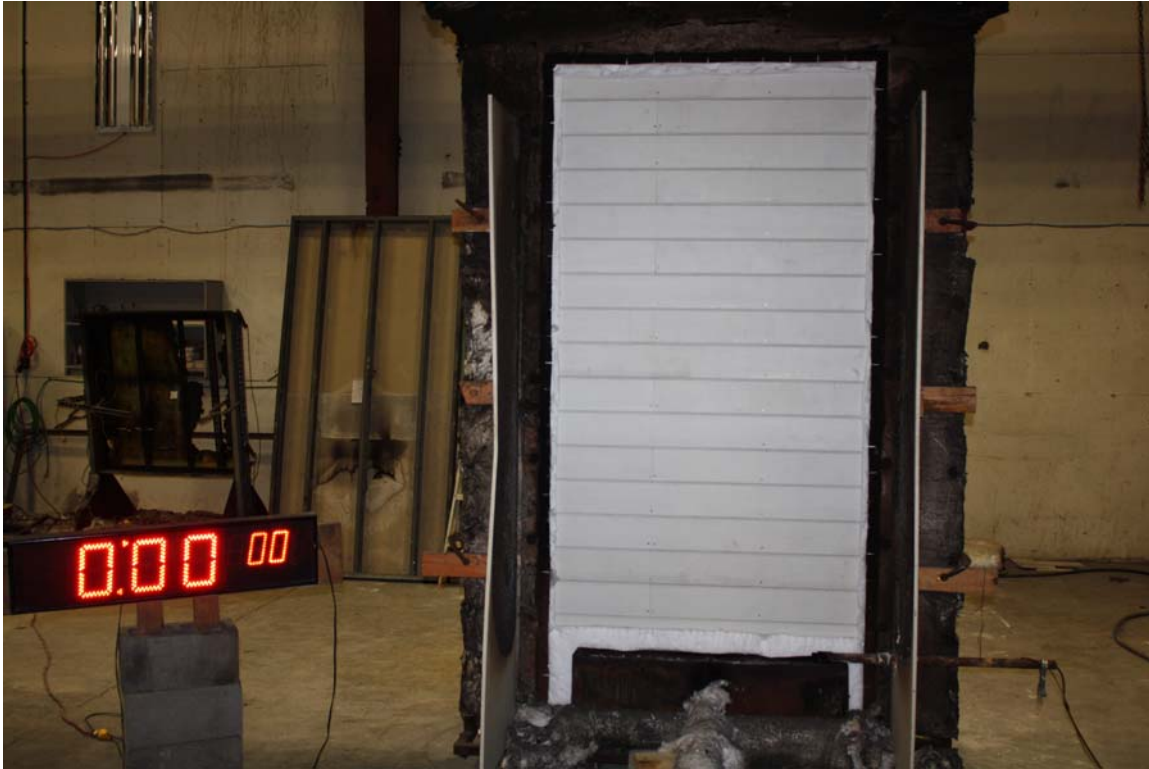
Test 4, v-rustic prior to test