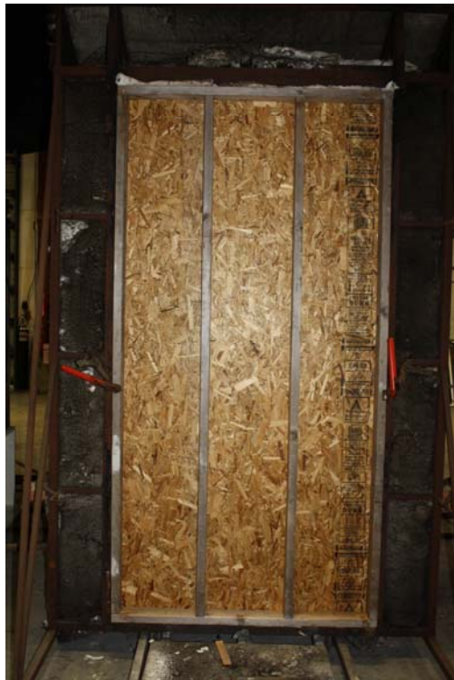
3 lap, unexposed side at test termination