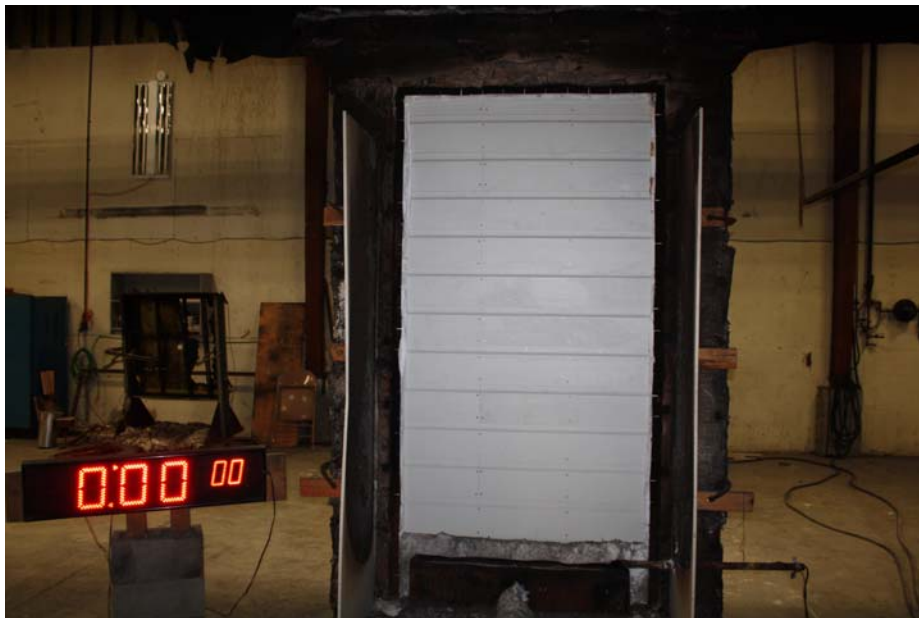
Test 1, prior to test