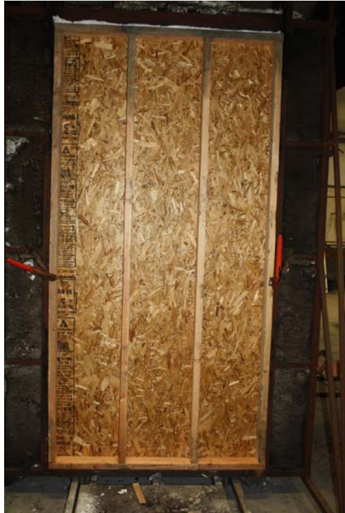
Test 4, v-rustic unexposed side at test termination