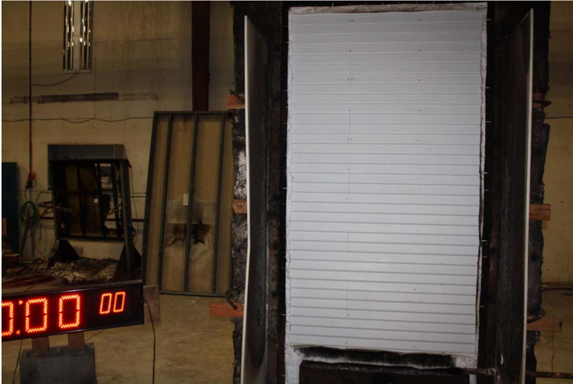
Test 7, 3 lap prior to test