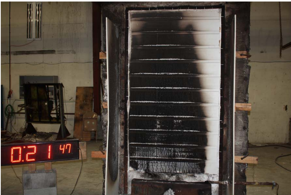
Test 1, at test termination