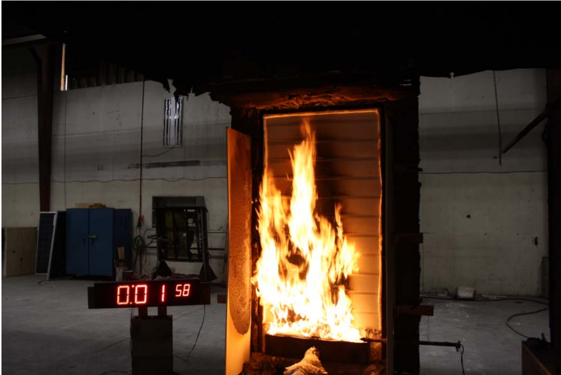
Test 1, early in test