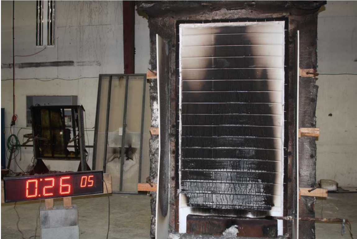
Test 4, v-rustic at test termination