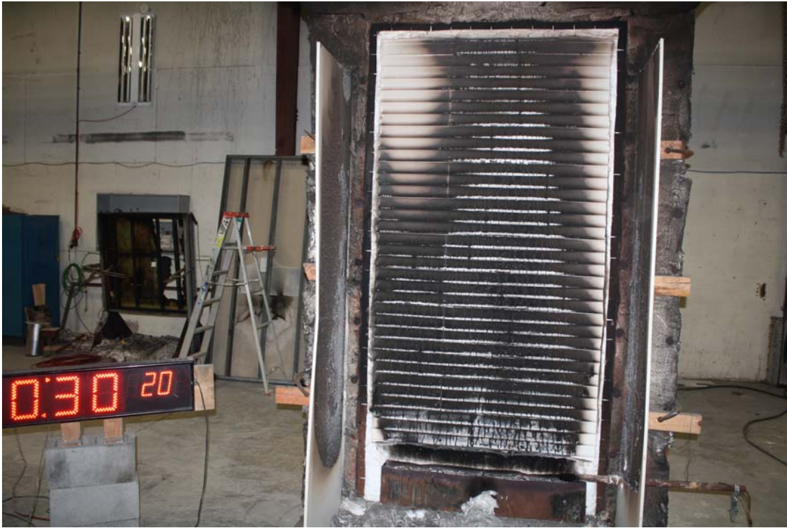
Test 7, 3 lap at test termination