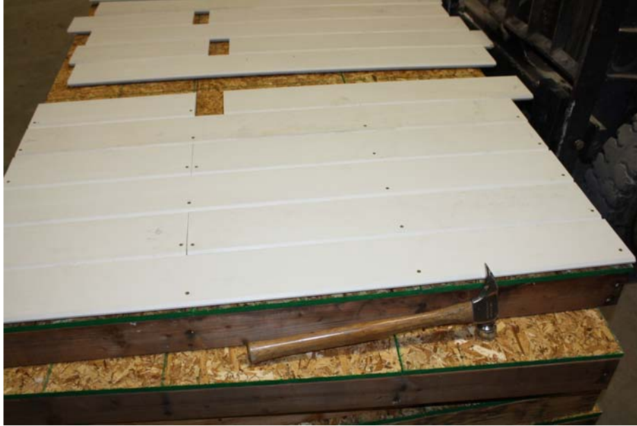
Test 1, Beveled channel under construction