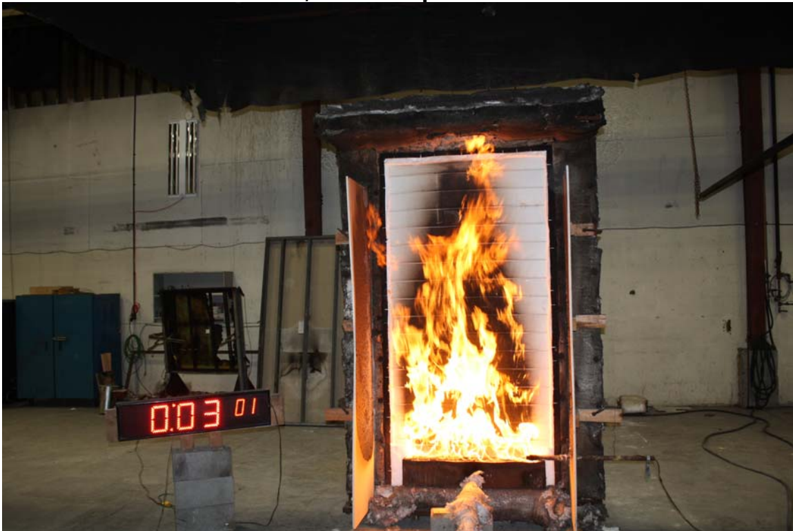
Test 4, v-rustic early in test