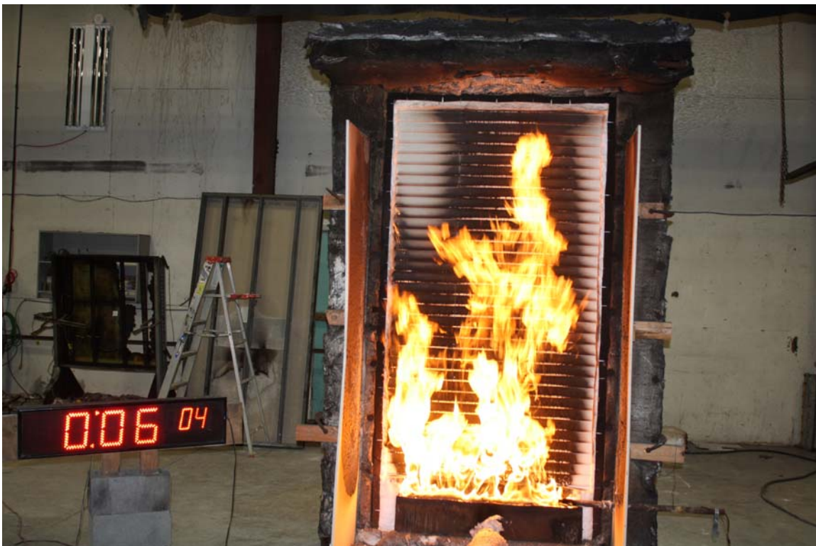
Test 7, 3 lap during burn exposure